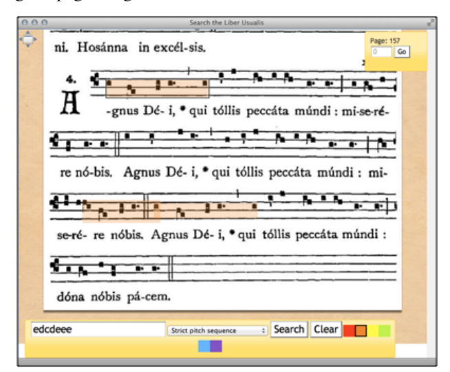
Figure 3: The Liber Usualis Interface

Using the co-ordinate data from the OMR and stored in the MEI, the results from a users' query for a pitch sequence will bring the user to the page where their result can be found, with the bounding box around the search result highlighting their query. Figure 3 shows a screenshot from our web application with the result of the pitch-sequence query " edcdeee " highlighted on the original page image of the LU.